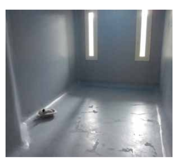
Round room at Mt Eden Corrections Facility.

The Ombudsman's 2012 investigation of prisoner health services suggested there are deficiencies regarding the care of mentally unwell prisoners. Significant unmet needs in prison were reported in terms of common mental health conditions including depression, anxiety, emotional distress and adjustment problems.