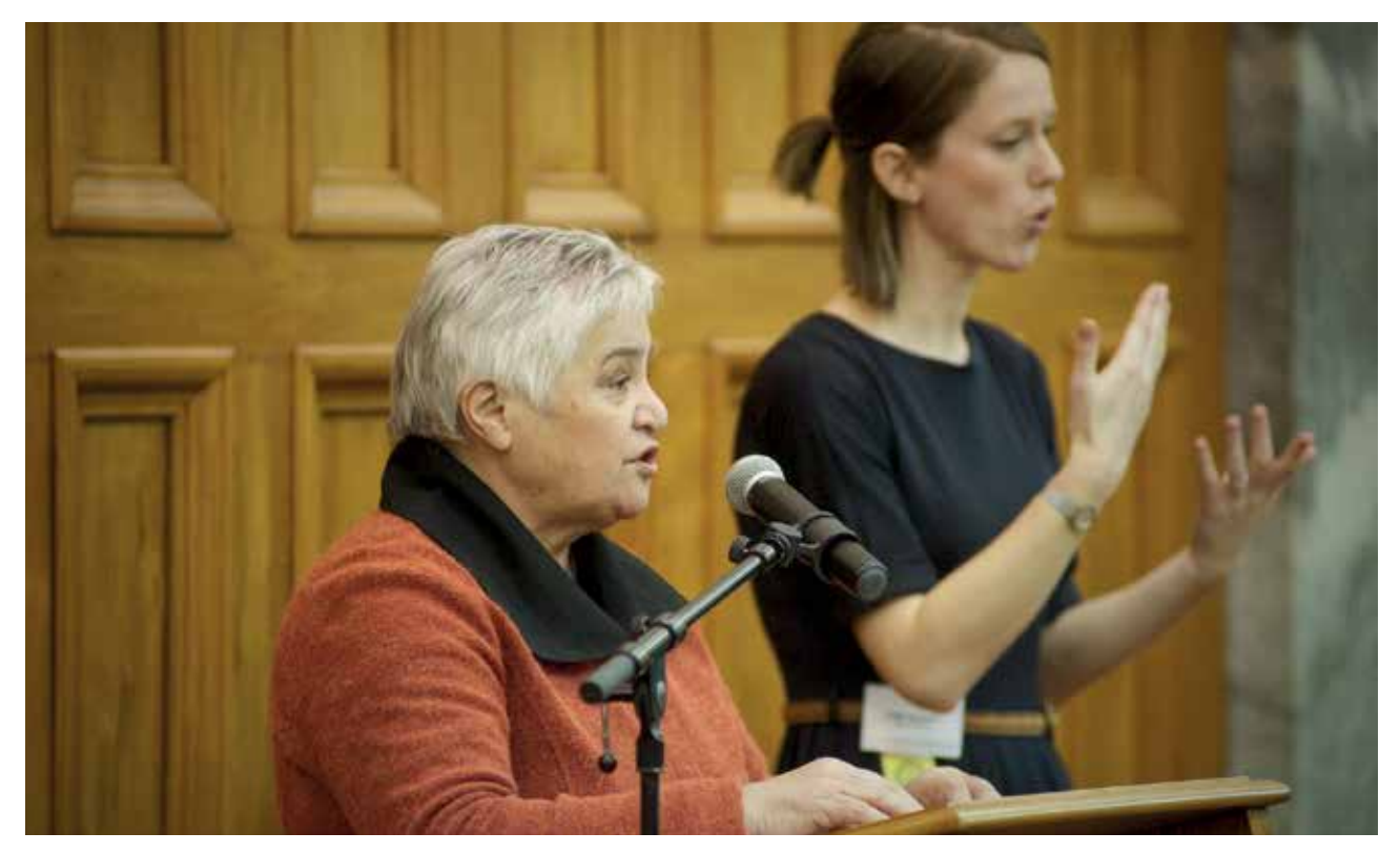
The Hon. Tariana Turia.

3 a person's decision-making skills being seen to be deficient (the functional approach).